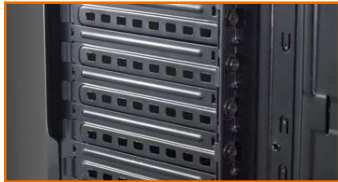
Vented slot covers for better airflow