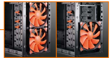
Front can install 2pcs 120mm fans or 1pcs 140mm fan for better airflow(Optional)