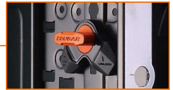
3.5" Screw-less device