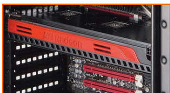
Support for long VGA card up to 320mm