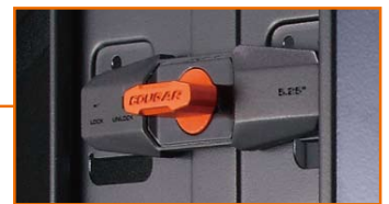
5.25" Screw-less device