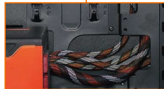
Cable routing management for easy routing and hiding cables