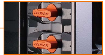
HDD Screw-less device