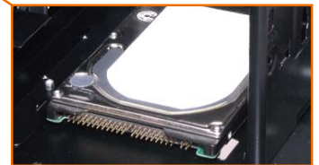
Support 2.5" HDD/SSD at bottom