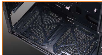
Air filter for the power supply fan