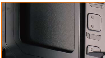
Huge hole for easy accessing the backplate of the CPU cooler