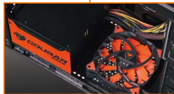
Bottom cover can install 1pcs 120mm fan for better airflow (Optional)