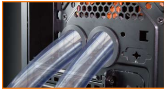
Holes for water cooling solution