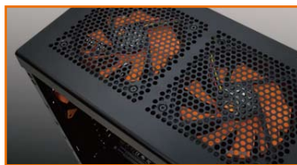
Top cover can install 2pcs 120mm fans for better airflow(Optional)